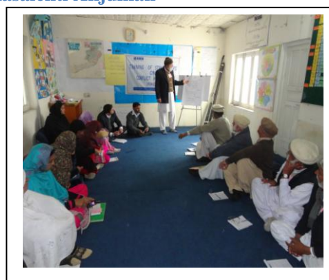
Capacity Building of Masalehti Anjuman

We aim to strengthen and convince communal set up on the concept of happy family. Trainings of 18 community organizations were conducted on the concept of happy family, values and human rights. These community organizations were also facilitated in identifying happy families within the villages and conduct discussion forums and analyze how these families became happy and link these with positive values, human rights. These forums are creating a conducive environment for victims of violence and creating a peer pressure for perpetrators. Community organisations and human rights activists have become a great support for women victims of violence with whom they have started exchanging their feelings and getting counseled.