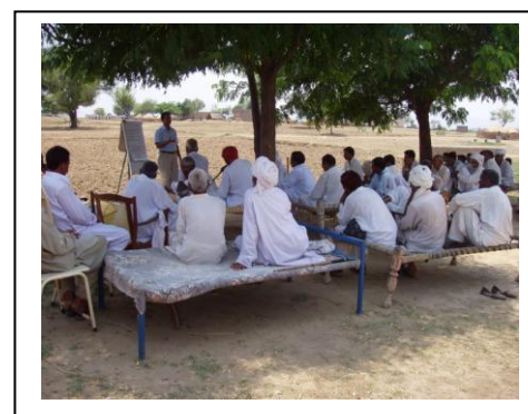
Capacity Building of VCC

The capacity building helped VCC manifold i.e. membership of 75 VCCs was raised to 1875. 375 women and 29 disabled persons are elected members of VCCs for their participation in communal decision-making. In total 79,000 members in 75 communities are benefitting from the development efforts. VCCs raised PKR 1.16 million as of their communal saving and 75 VCCs have their organizational accounts to deposit communal saving. 17 VCCs (10 in Sohawa, 3 in Bhakar and 4 in Skardu) established their communal enterprises for financial resource mobilization. These communal enterprises resulted in earning a profit of PKR 0.25 million other than