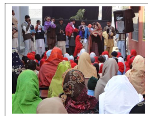
Puppet Show in Schools

Primary education of children is promoted as a basic right of all children. 25 children with disabilities have been admitted in primary education. This has boosted their confidence and socialization skills. Teachers and non-disabled children have also realized the importance of inclusion of children with disability in education.