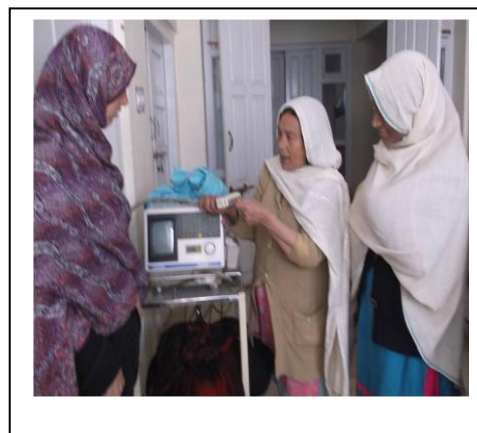
Capacity Building of SBAs

e. These awareness raising messages were aired on local cable networks and local radio stations for wider dissemination.