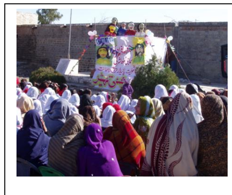
Puppet Show on Inclusion of WSVs

A mass awareness raising campaign was launched at village and Tehsil level through multiple mediums such as radio programmes, newspaper coverage, interactive theatre shows, puppet shows, discussion forums and commemoration of National and International Human Rights Days. Our awareness raising campaign reached to more than 14000 community members. The campaign has developed a sense of realization among the communities to show reverence for human rights, which particularly include the rights of women.