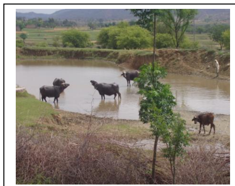
Water Conservation Dam

Pakistan is an agrarian country and its economy is hugely dependent upon cropping and its productions. Irrigation water particularly in rain fed areas is either entirely not available or the depth of the water table does not permit its use for