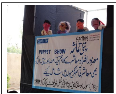
Puppet Show on Inclusion of PWDs

For the social inclusion of the PWDs 30 puppet shows in 20 villages and 10 schools have been conducted on the theme of inclusive development by community organizations. These shows were attended by more than 9,000 community members of all ages and genders especially women, children, elderly people and youth. As a result of awareness raising activities, there has been a considerable change in their lives, which has made them realize their existence in their families. They have begun to participate in social activities being held in their villages. In result of this effort, the community organizations, families and communities of people with disabilities have welcomed the idea of mainstreaming people with disabilities in the local decision making process and participation in social events as well.