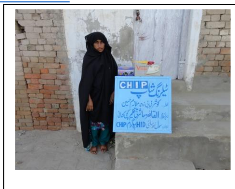
Provision of Enterprise Material

Assessment and referral facility has been established with District Social Welfare Department. 27 of a total of 29 medically assessed disabled persons have received their disability certificates and are entitled for benefits and exemption on fares, taxes and fee.