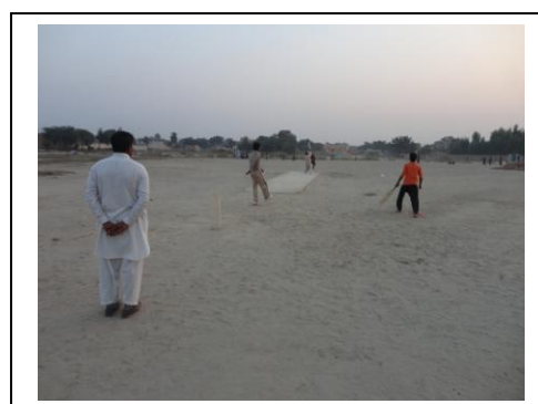
Inclusion of Disabled in Sports

Village level sports are promoted among children and youth. They are made aware to include children and youth with disabilities in sports activities. As a result, about 10 youth with disabilities participated in sports and are members of their village sports' teams.