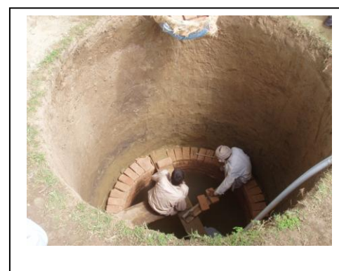
Construction of Well

Since ages, availability of drinking water has been one of the vital reasons for development of localities. Due to natural climatic changes, excessive use and increase in population, water quantity is reducing day by day. Secondly, quality of ground water is affected to a large extent due to human i.e. construction of soakage pits in areas with high water tables etc. Keeping in view the access and availability of the communities towards water facilities, 5 existing communal wells were rehabilitated. Community contributed 30% of the total as of their share in the water resource development projects. 6 water sources (2 hand pumps, 2 shallow wells & 2wells) were installed in 6 villages (ArnialPhoolan, GurrahUtam Singh, DhokTahliyan, MiyaniBala, PamalFrash andBelaMohrra). 137 Households benefited from 6 water sources. 6 water committees comprising of 15 members were formed.