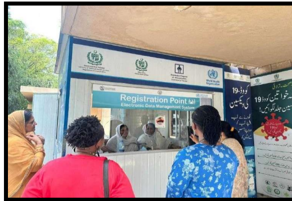
Interaction with the Lady Health Workers in Action