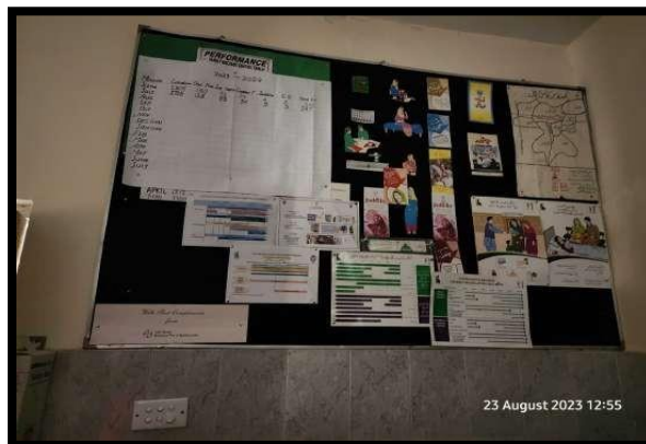
Data Chart at RHC Tarlai, showing reproductive health services offered in a specific month