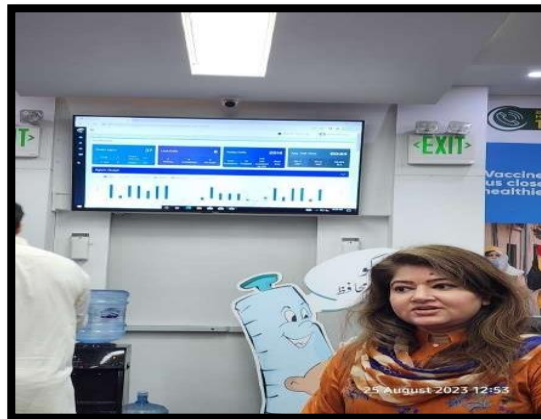
FDI's Immunization Call Center, Tracked Call Center Metrics visible on the screen