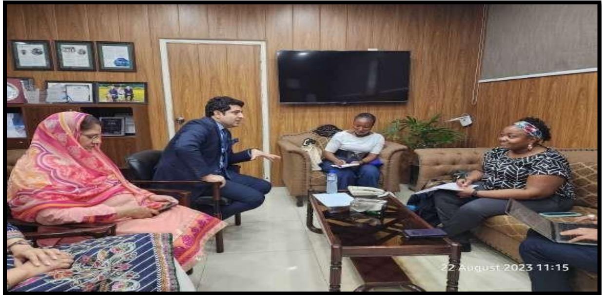
Office of the District Health Officer, Islamabad