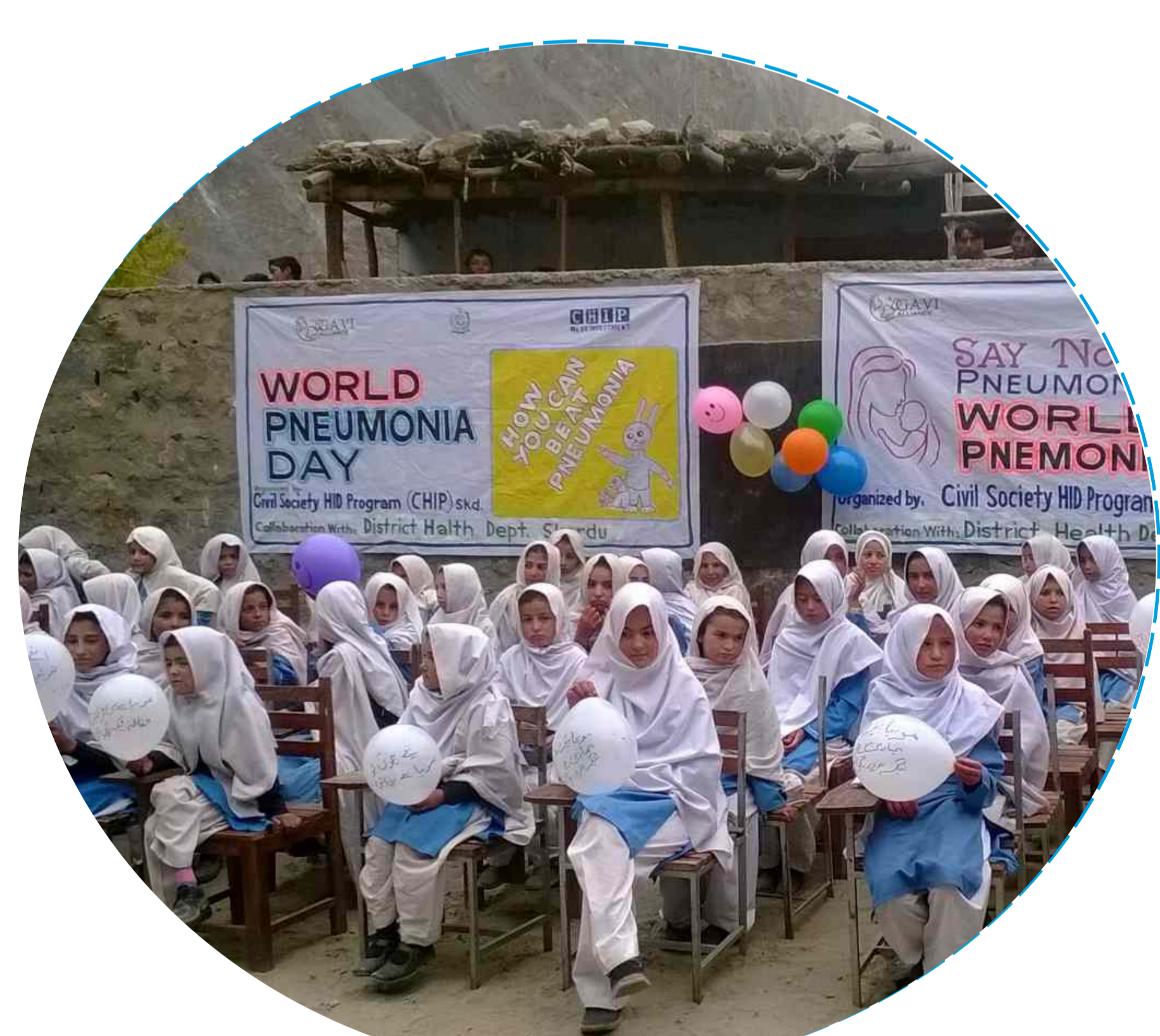
Involving Siblings of Children