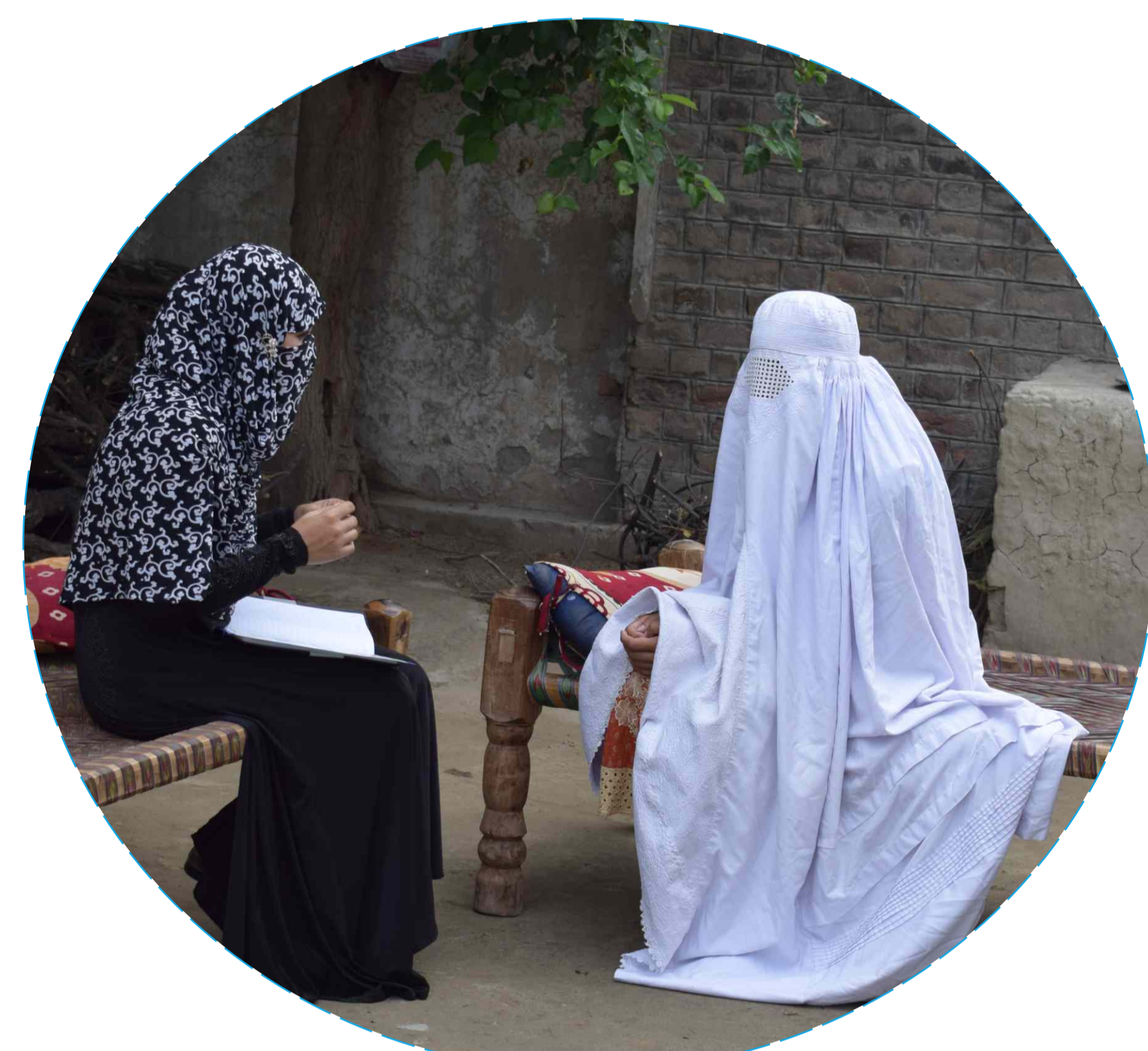
Individual Attention and Support