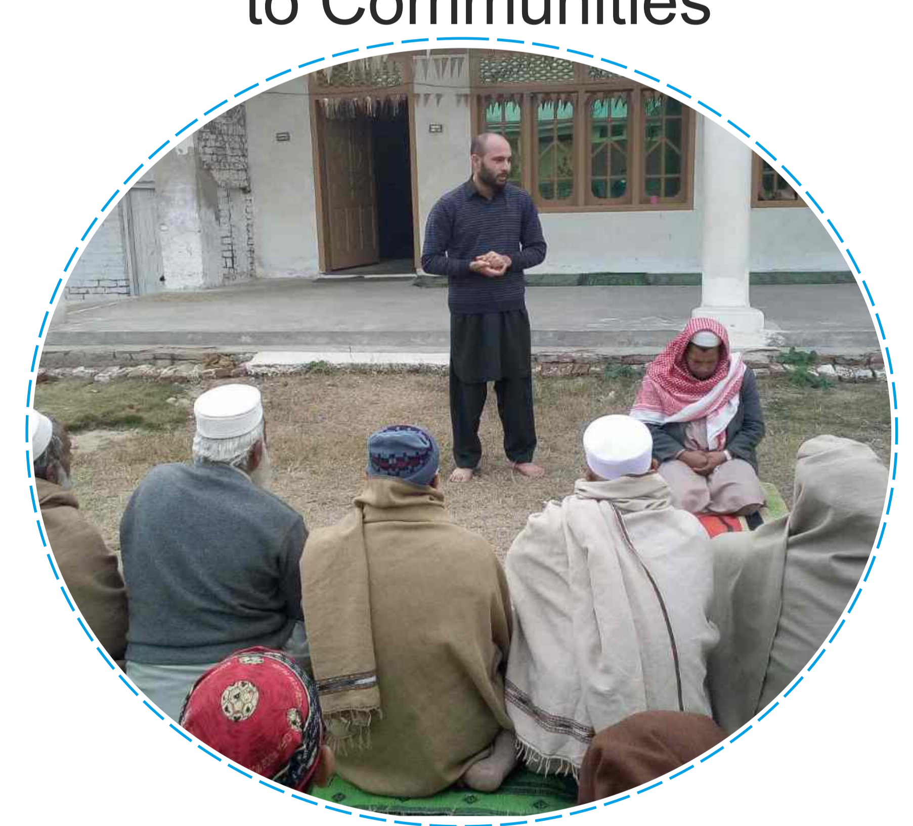
Engaging Religious Leaders