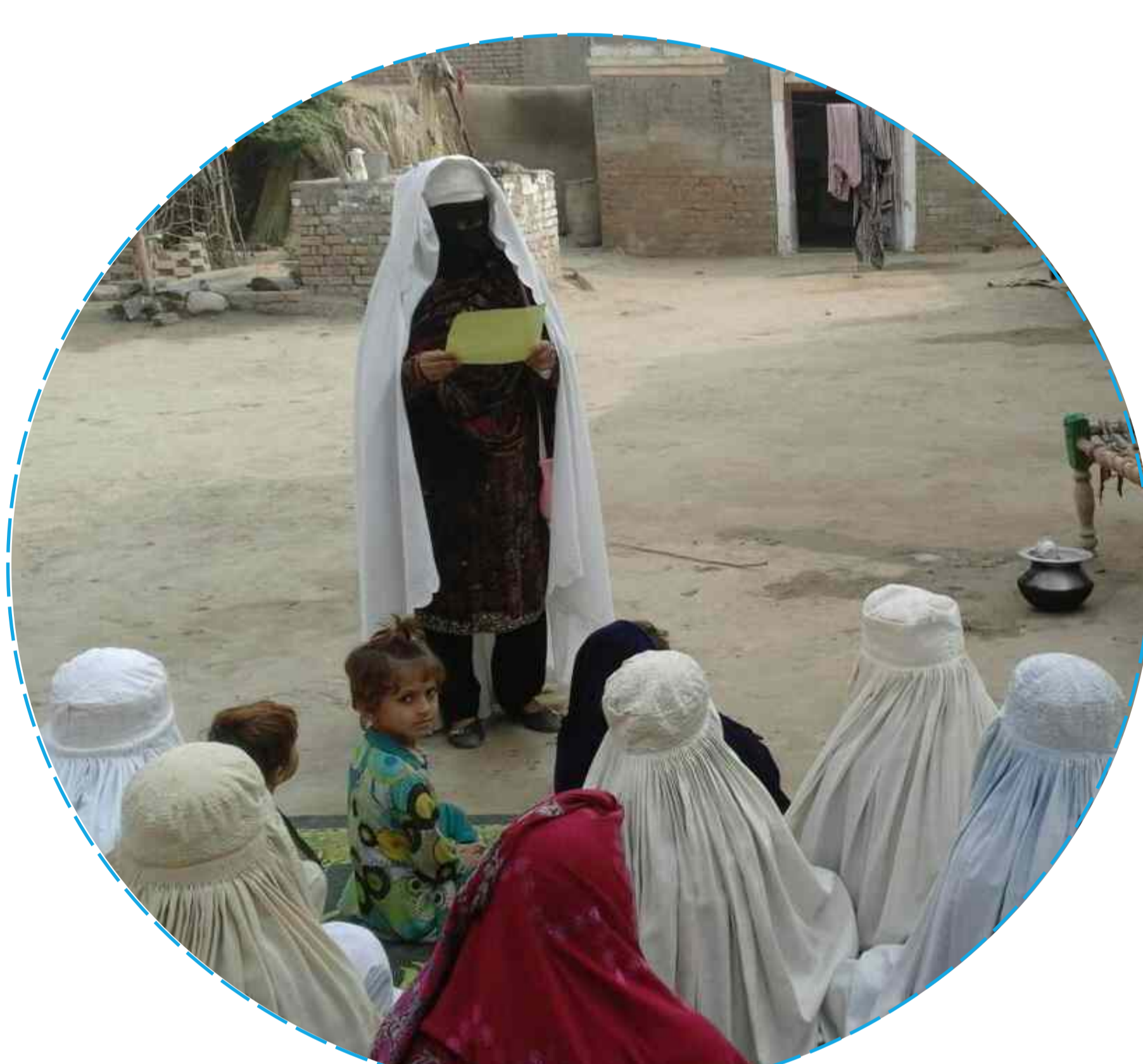
Develop Health Workers as Local Human Resource