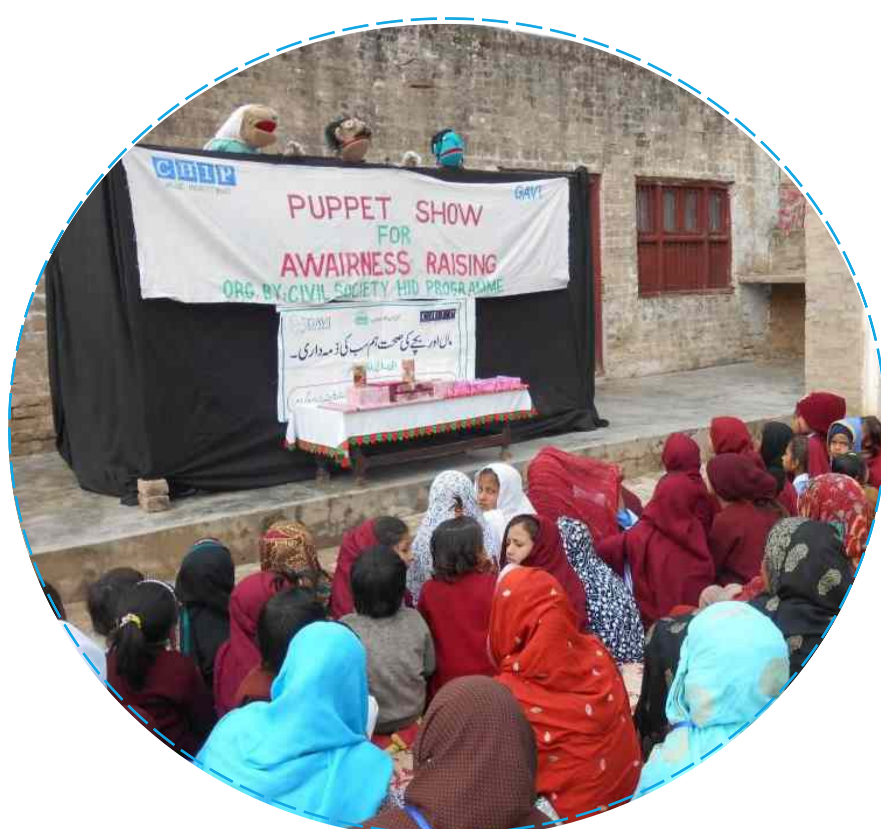
Creating Peer Support