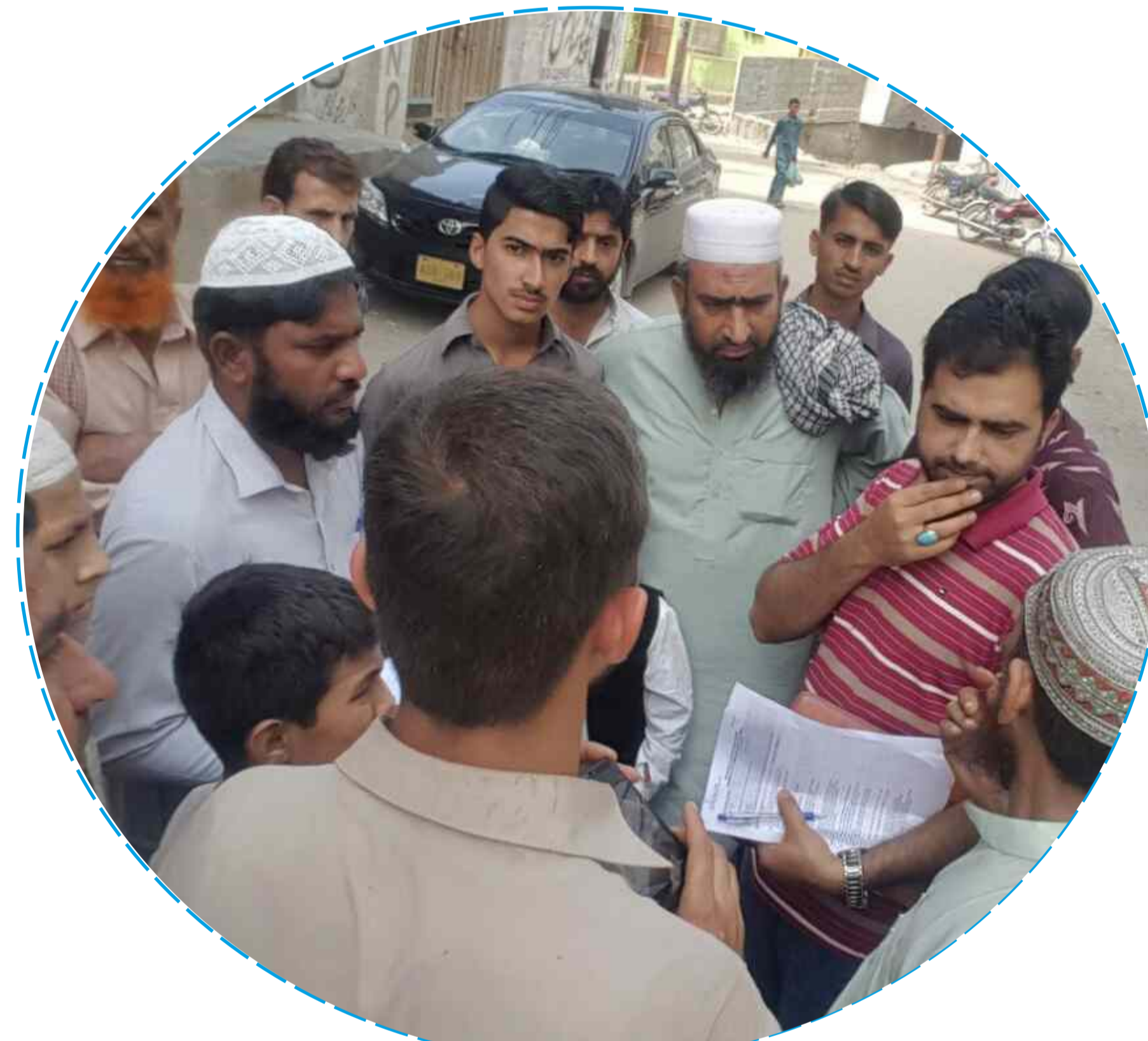
Handing Over Responsibility to Communities