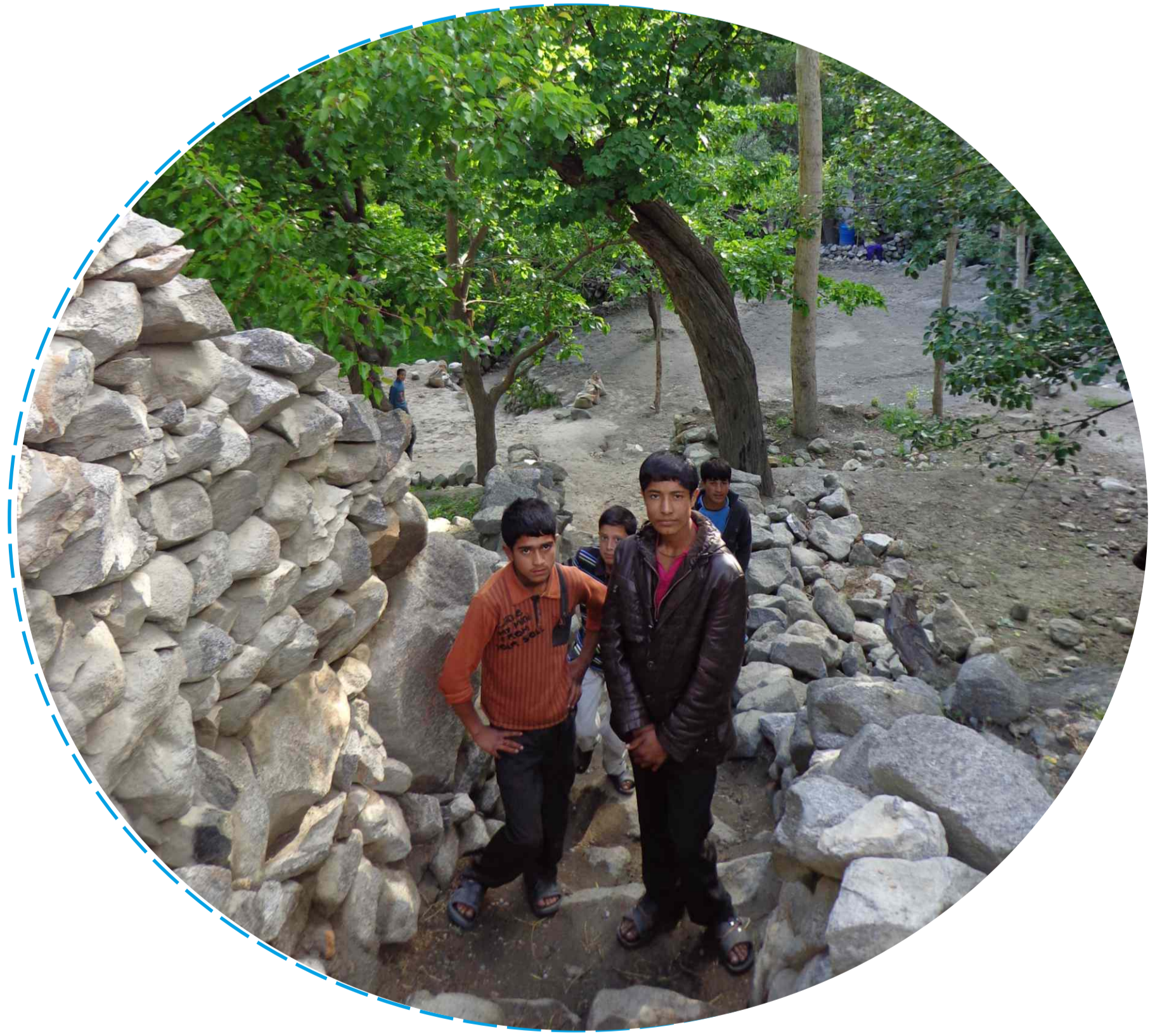
Geographical and Social Coverage